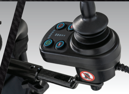
Optional Attendant Control Bracket